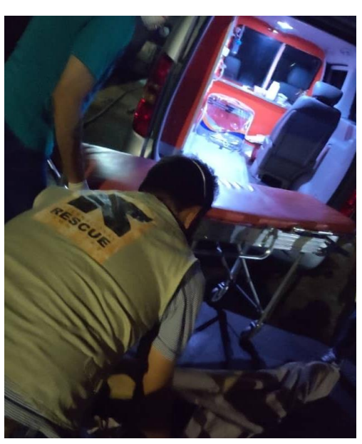
UNHCR's partner, IRC providing urgent medical assistance at a disembarkation point.

As of 17 September, 8,074 refugees and migrants have been registered as rescued/intercepted at sea by the Libyan Coast Guard (LCG) and disembarked in Libya. On September, 45 individuals who survived the capsizing of a boat arrived at the Tripoli Naval Base. 22 were reportedly missing while two bodies were retrieved by the LCG. UNHCR underlines that Libya is not a safe port for disembarkations and urges States to strengthen search and rescue efforts in the Mediterranean to prevent loss of lives. UNHCR and its partner, the International Rescue Committee (IRC), are present at disembarkation points to provide urgent medical assistance and core relief items (CRIs) before individuals are transferred to detention centres by the Libyan authorities.