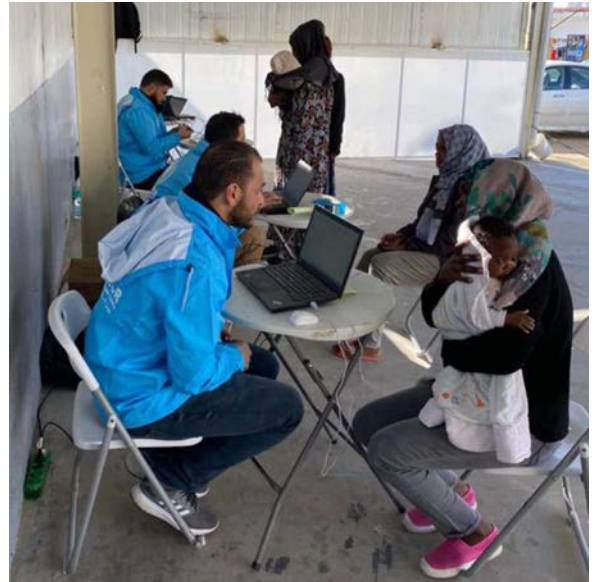
UNHCR conducting registration activities at Triq Al Sika detention centre in Tripoli.

On 15 January, a total of 19 refugees and asylum-seekers were released from Triq Al Sika detention centre, following UNHCR's advocacy. The group, comprising two men, 13 women and four children, were transferred to the CDC. They were provided with core-relief items (CRIs), cash grants and medical assistance.