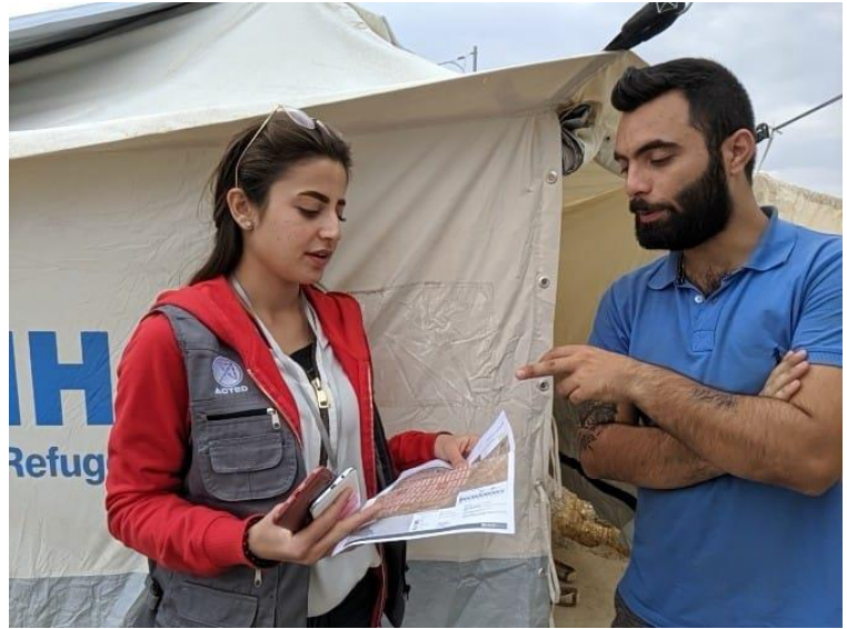
Partners conducting tent to tent protection assessments in Bardarash refugee camp

Since the beginning of the emergency, two camps have been designated to host the new arrivals -- Bardarash Refugee Camp, which previously hosted internally displaced Iraqis; and Gawilan Refugee Camp, which already hosts over 7,000 Syrian refugees who fled to Iraq prior to this emergency. As both locations are now reaching full capacity, the authorities in Dohuk Governorate are identifying an additional site to accommodate new arrivals. As of 9 November 2019, out of the total 14,779 Syrian refugees who have entered the KR-I, over 12,000 individuals are hosted in Bardarash Refugee Camp, and over 2,000 new refugees are in Gawilan Refugee Camp.