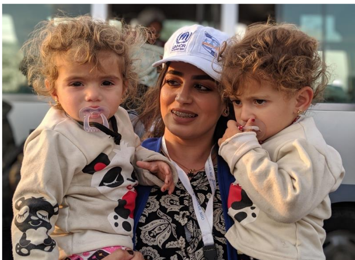
Partners assisting newly arrived refugees at Gawilan refugee camp

Recent military operations in North East Syria forced thousands of people to flee their homes and to seek safety across the border in neighbouring Iraq. As of 9 November 2019, some 14,779 Syrian refugees have crossed into the Kurdistan Region of Iraq. Most new arrivals are originally from Ras al Ain and Ain Al Arab, followed by Qamishli and Darbasiyah.