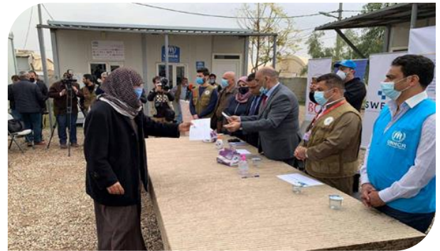
Distribution of civil documentation in Hasansham U3 IDP Camp in Duhok Governorate December 2020

In collaboration with the Ministry of Interior (MoI) of the Federal Government of Iraq as well as the Kurdistan Regional Government, mobile missions covering 6 IDP camps under the administration of Erbil Governorate were undertaken in December. The mission resulted in the issuance of a total of 1,867 Civil Status (CS) IDs and 753 Iraqi Nationality Certificates (INCs) to IDPs. A further 457 UIDs that had been applied for in 2019 through mobile missions were also distributed this year to IDPs in Erbil. Earlier in the year missions were undertaken to 1 camp in Kirkuk Governorate resulting in the issuance of 175 CSIDs and 38 INCs , and a mission was also undertaken to 2 IDP camps in Sulaymaniyah for the issuance of 120 Unified IDs that had been applied for during missions in 2019.