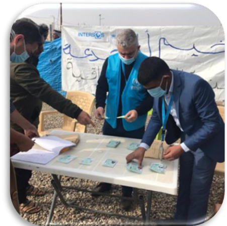
Distribution of civil documentation in Jeddah IDP Camp Ninewa Governorate December 2020

Given the grave consequences and challenges faced by IDPs and returnees who lack key civil documents, UNHCR, in cooperation with government and civil society partners, has implemented and supported a number of projects to enable IDPs and returnees to access civil documentation.