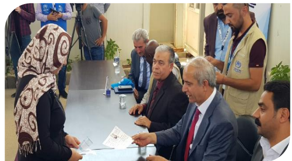
Distribution of civil documents in Bersive camp in Duhok Governorate.

Since April 2019, UNHCR has collaborated with the Ministry of Interior (MoI) of the Federal Government of Iraq to implement mobile missions dispatching government officials to issue civil documentation to IDPs in camps and out-of-camp locations. To date, with the collaboration of the Kurdistan Regional Government (KRG), MoI has launched missions to issue Civil Status IDs (CSIDs), Iraqi Nationality Certificates (INCs) and Unified National IDs (UNIDs) to IDPs across Erbil, Duhok, Sulaymaniyah and Kirkuk Governorates. For much of this year these missions were suspended owing to the COVID-19 related closure of civil affairs offices, with only distributions of documents applied for in 2019 taking place during this time. The missions are to resume in December and will continue into 2021, focusing on the remaining IDP camps. As of the end of November, MoI had issued a total of 8,309 CSIDs, 14,193 INCs and 1,006 UNIDs to IDPs through these mobile missions since the project was initiated in 2019.