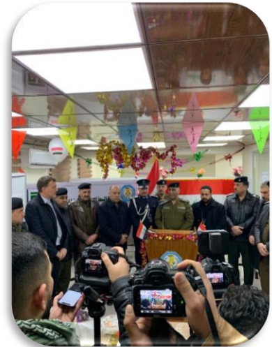
Inauguration ceremony of the National Identification Card Centre in Ninewa Governorate

Given the grave consequences and challenges faced by IDPs and returnees who lack key civil documents, UNHCR, in cooperation with government and civil society partners, has implemented and supported a number of projects to enable IDPs and returnees to access civil documentation.