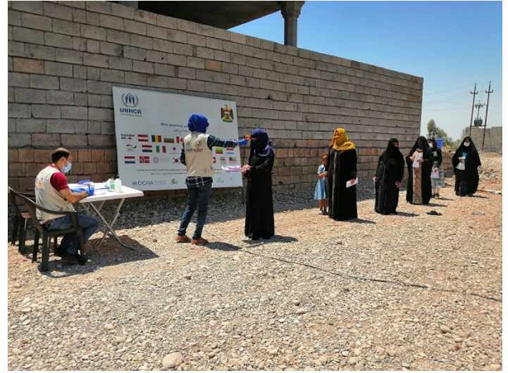
IDP women and girls of reproductive age in Tuz - Kirkuk being assisted with sanitary kits.