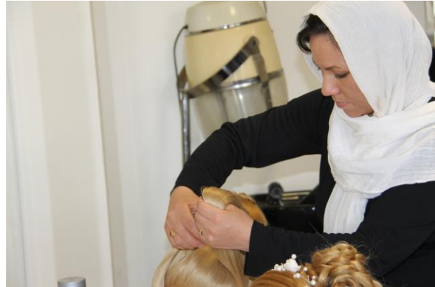
Through technical and vocational training courses young Afghan refugees in Iran develop in-demand, marketable skills.

Regarding resettlement to third countries, in September 2019, 8 individuals (1 family) were accepted by New Zealand and another family of three individuals was accepted by Australia. Also during the reporting period, 3 individuals (1 family) departed to Australia, 3 individuals (1 family) departed to New Zealand, and 9 individuals (3 families) departed to the UK. Furthermore in the same reporting period, 6 individuals (1 family) were rejected by the UK.