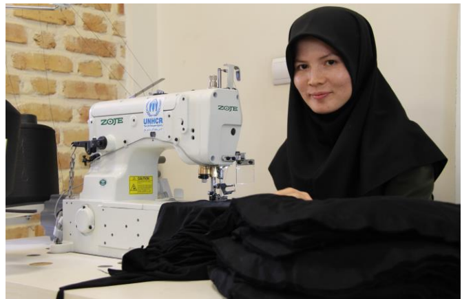
The Government of Iran, UNHCR and its non-governmental partners assist Afghan refugee entrepreneurs with business start-ups.