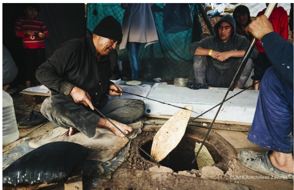
An Afghan asylum-seeker bakes bread in a makeshift ground oven at the informal expansion of Moria reception centre on Lesbos.

4 Field Units in Evros, Ioannina, Leros, Rhodes