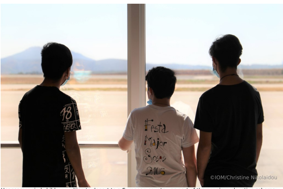
Unaccompanied children waiting to depart to a European country, as part of the ongoing relocation scheme.