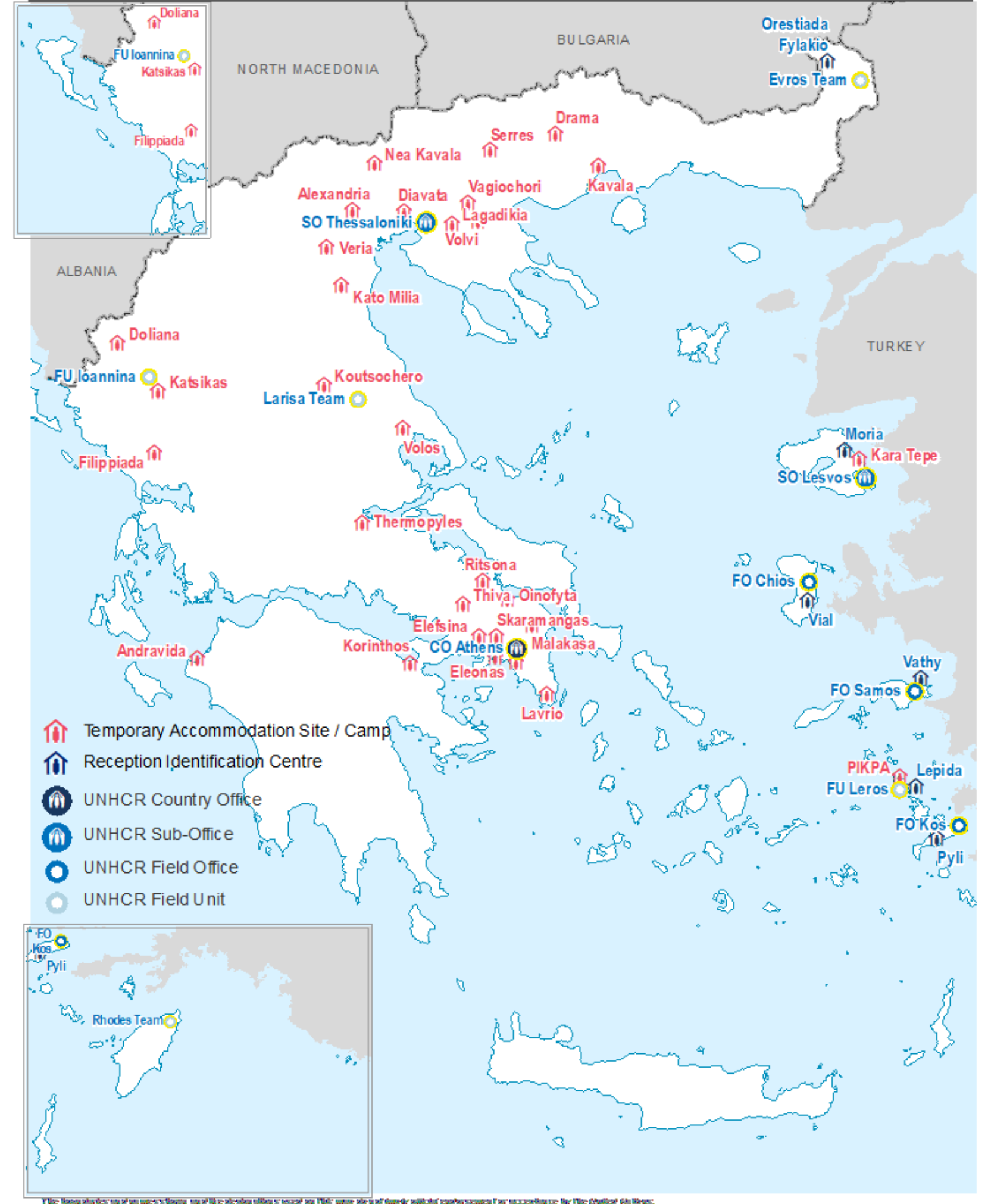
Printing state: 15 May 2020 Sconces: UNHCR Author: Bekim Kajiszi Erzelkards: greating)u