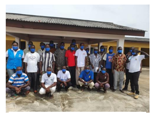
The Chief of Ampain together with his elders wearing the masks donated by UNHCR.