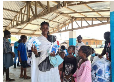
A happy nursing mother who just received face masks for her family at Ampain Camp.