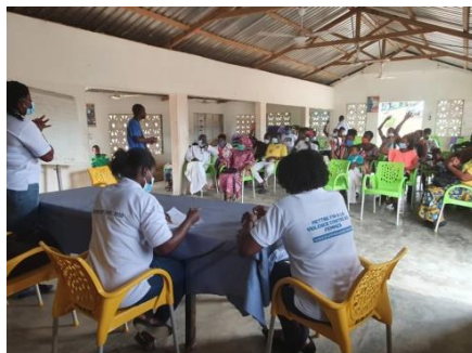
Open day interactions with new arrivals in Egyeikrom Camp.