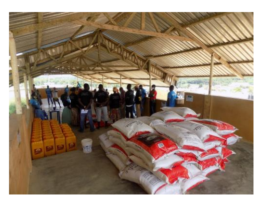
One-time food donation by UNHCR to refugees to mark World Refugee Day. Pix from Egyeikrom