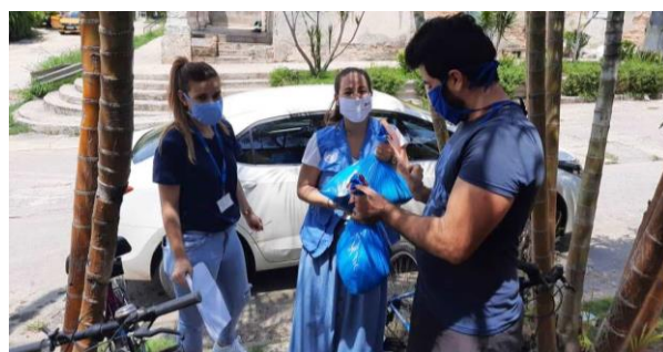
To address the needs of people of concern during the pandemic, UNHCR in Cuba delivers basic goods to refugee and asylum seeker families. UNHCR Cuba