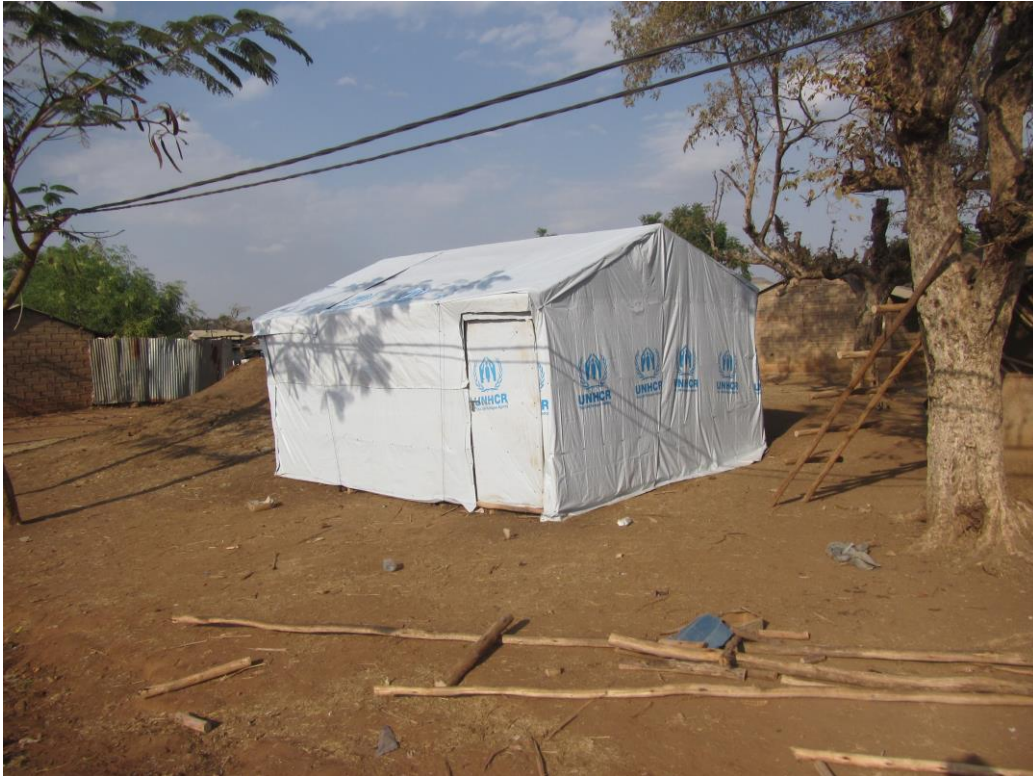
Emergency shelter in Mai Aini refugee camp in Tigray region.