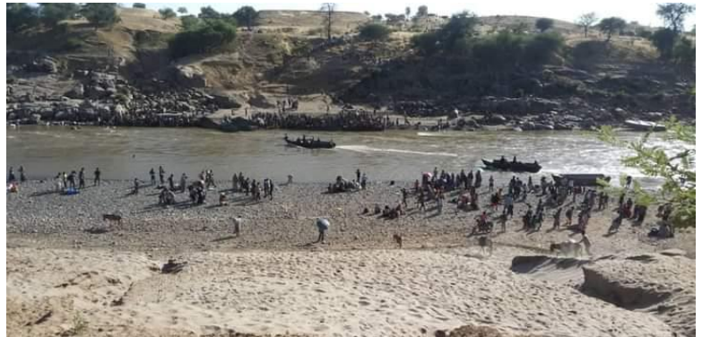
New arrivals from Ethiopia at the border point in Hamdayet in Kassala State, Sudan.

Sudan: The border is open to civilians. UNHCR and the Commissioner for Refugees (COR) have reported the arrival of some 7,000 Ethiopian asylum seekers at two border entry points in Sudan's Gedaref and Kassala States. UNHCR and local authorities are jointly screening and registering people. UNHCR and COR are currently identifying a new refugee site in Gedaref where UNHCR will be re-opening an office. Interviews with newly arriving refugees are underway to shed more light on what movements may be occurring inside Ethiopia to assess possible numbers. Reports suggest that the numbers of new arrivals will continue to rise sharply, which will require a significant mobilisation of resource to address the growing needs.