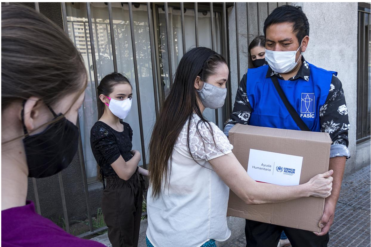
Asylum-seeker woman receives a food box distributed by UNHCR and its partner agency FASIC.

During the holiday season, our agency donated hundreds of toys and food boxes to refugees and migrants living in the cities of Santiago, Arica and Antofagasta