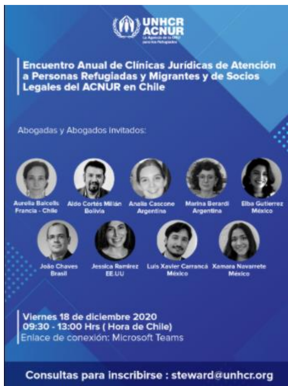
Poster of the activity © UNHCR, December 2020.