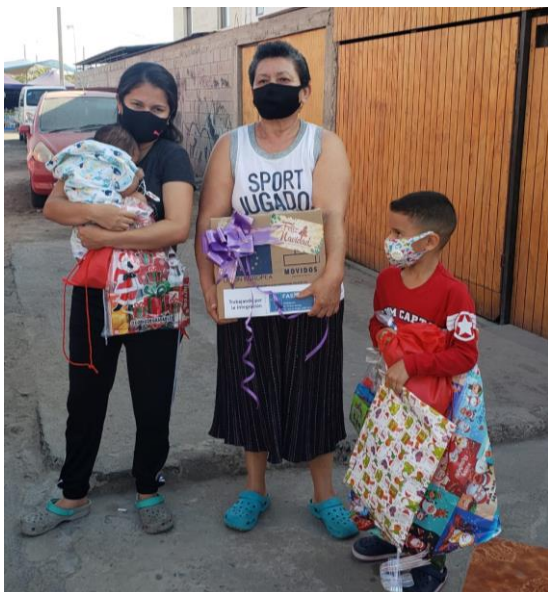
Family receiving gifts and sweets bags in Arica, December 2020.