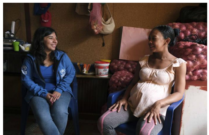
Figure 1. Arica, Chile. UNHCR staff visiting a Cuban asylum-seeker hosted in the country.