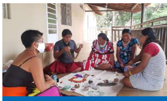
Peaceful coexistence - Warao women in a craft and entrepreneurship workshop with Ticuna indigenous in Belo Horizonte: support of SJMR and the Minas Gerais Indigenous Committee as a result of the Warao GT.

On January 26, UNHCR São Paulo trained 74 employees of the Regional Superintendence of Caixa Econômica Federal (Public National Bank) in Belo Horizonte. In partnership with the Indigenous Committee of Minas Gerais and the Jesuit Service for Migrants and Refugees (SJMR), the training addressed the issue of forced displacement, migration and indigenous population (Warao and other ethnicities), resulting from a recommendation issued by the DPU and the MPF to respond to barriers of access to bank services by indigenous Warao. The demand stems from the multi-actor Working Group, created to support the protection and integration of Warao families in Belo Horizonte. On February 4, UNHCR also trained 15 employees from the Montes Claros public social assistance network, in partnership with IOM. The training addressed the Warao culture, challenges, guidelines and successful practices in assisting this population. Since November 2019, 267 indigenous Warao have been accompanied by UNHCR São Paulo through Working Groups in the cities of Belo Horizonte, Campinas/Hortolândia, Montes Claros, Nova Iguaçu/Japeri, Rio de Janeiro, São Paulo and Uberlândia.