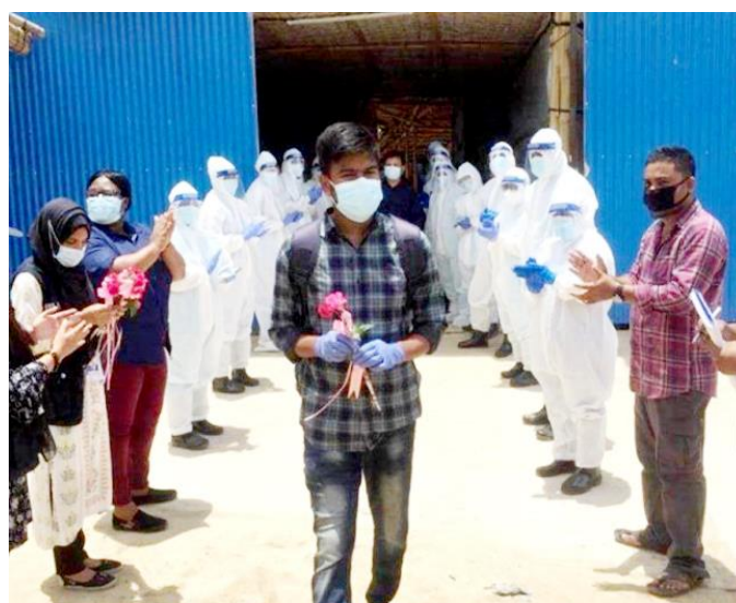
Health staff at UNHCR supported COVID-19 treatment centre send off the first patient to recover and be discharged.