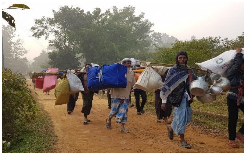
The relocation of refugees from Bandarban to Kutupalong settlement began on 14 January 2018.

A Joint Response Plan, covering the period from March to December 2018, is under preparation