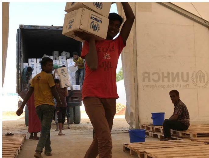
Speeding up delivery of aid to Rohingya refugees.