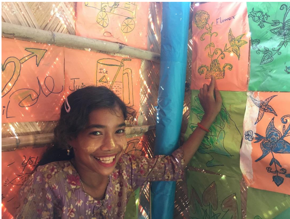
A young Rohingya refugee girl at a learning centre in Kutupalong extension site.