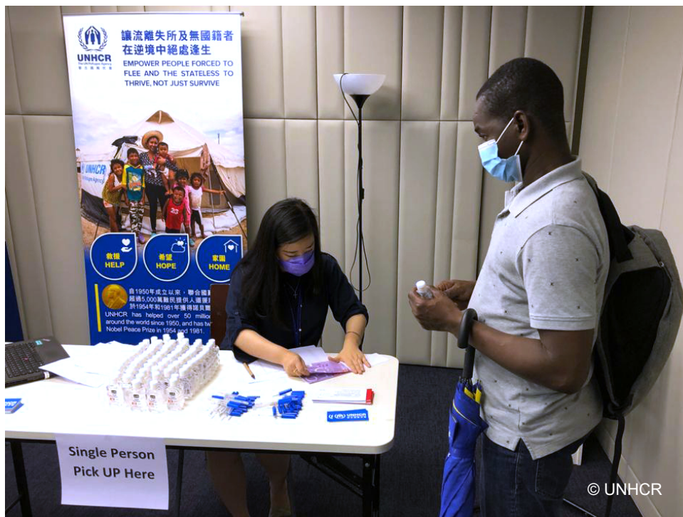
UNHCR China Sub-Office Hong Kong SAR teamed up with a local partner to distribute personal protective equipment to refugees including hand sanitizer, thermometers and cash vouchers to support their needs during the COVID-19 pandemic.

Kazakhstan: USD 270,000 | Kyrgyzstan: USD 470,000 | Tajikistan: USD 440,000