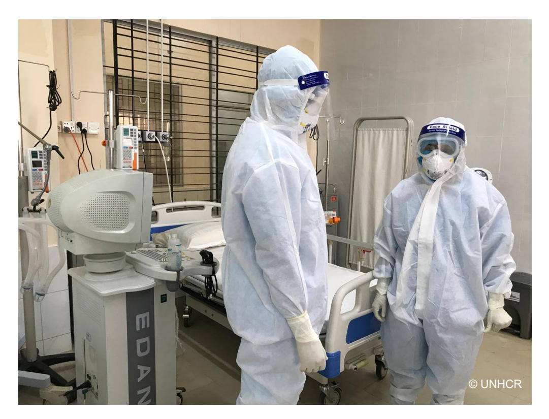
On 20 June 2020, the first Intensive Care Unit (ICU) in Cox's Bazar was inaugurated with UNHCR's support. The facility has 10 intensive care and 8 high-dependency beds.

Kazakhstan: USD 270,000 | Kyrgyzstan: USD 470,000 | Tajikistan: USD 440,000