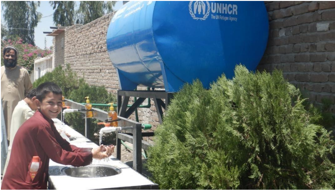
Children wash their hands at a new handwashing facility in Nangarhar, eastern Afghanistan, in an effort to prevent the spread of COVID-19.