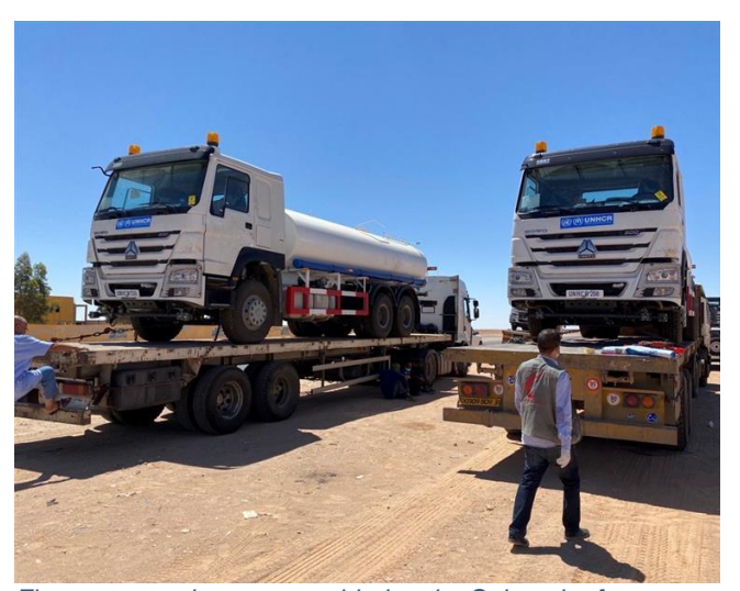
Five water trucks were provided to the Sahrawi refugee community in May, making a total of eight since April.

During COVID-19 the pandemic. UNHCR has adapted its activities to the changing circumstances, while continuing to provide lifesaving assistance.