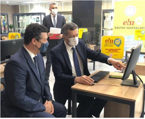
The Minister of National Education and UNHCR Representative at the launch of the EBA support centres

On 23 June, UNHCR Representative participated in the launch of the Ministry of National Education's Electronic Information Network points (EBA points) which were established in 114 schools with the support of UNHCR. The EBA support centres were set up in 16 provinces across the country and can each accommodate 15 to 20 students. UNHCR provided around 2,060 computers which were distributed in the centres, in addition to teacher support and laptops for the teachers. At the launch, the Minister of National Education, Mr. Ziya Selçuk, highlighted the support provided to students; the ministry had distributed close to one million tablets with 25 GB internet capacity to students throughout Turkey. The Minister indicated his hope that support would continue, not only as a temporary measure during the pandemic but in line with Turkey's long-term goals and vision in education.