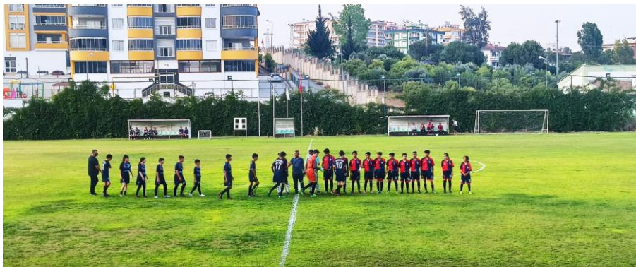
Turkish and refugee youth take part in friendly football match in Tarsus district