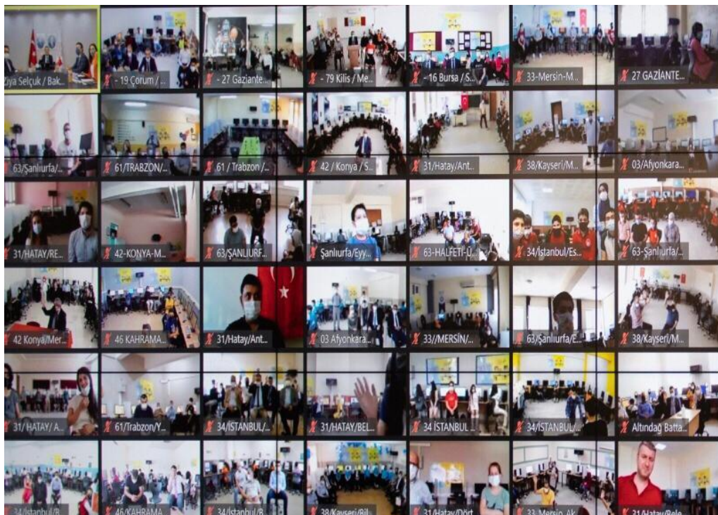
Online representation of students and teachers of the EBA support points established in 114 schools in 16 provinces through collaboration of the Ministry of National Education and UNHCR.