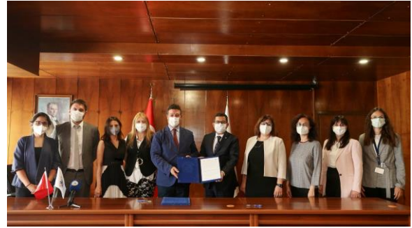
UNHCR signed an LOU with Dokuz Eylül University to strengthen ongoing collaboration on various activities

On 10-11 June, the Representative was on mission to the southern province of Mersin where he took part in the kick-off of a football match in Tarsus district where refugee children are included in sports activities. The Representative participated in a number of engagements during the mission, including a working dinner hosted by the Tarsus District Mayor with government and NGO officials including the Tarsus District Governor to discuss potential areas of cooperation; as well as meetings with the Governor of Mersin and senior officials to discuss opportunities between UNHCR and relevant institutions to improve the protection space.