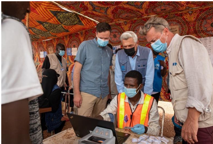
Norwegian Minister Dag Inge Ulstein and UNHCR HC Filippo Grandi visiting a food distribution point in Um Rakuba