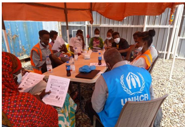
PSEA training in Um Rakuba camp