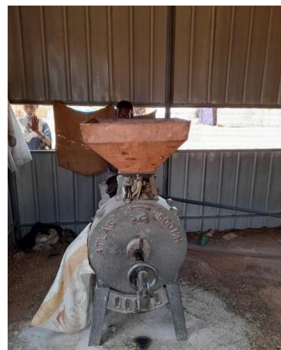
Two grinding mills are now operational in Um Rakuba camp