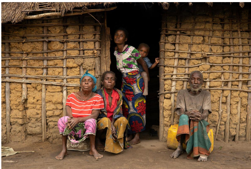
An indigenous family in front of their house in Vono Village, Republic of the Congo. None in the family has identity documents, posing a risk of statelessness. See story on page 7.

COVID-19: Vaccination rollout continued for persons of concern, as outreach was conducted to address vaccine hesitancy.