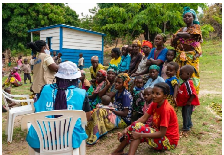
UNHCR and Protection Cluster partner speak with internally displaced women about their needs and concerns in Bitobolo, DRC.