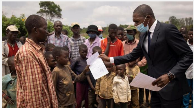
Director for the Promotion of Indigenous People's Rights at the Ministry of Justice, Republic of the Congo, hands over a birth certificate to an indigenous boy in Ngoulayo site.