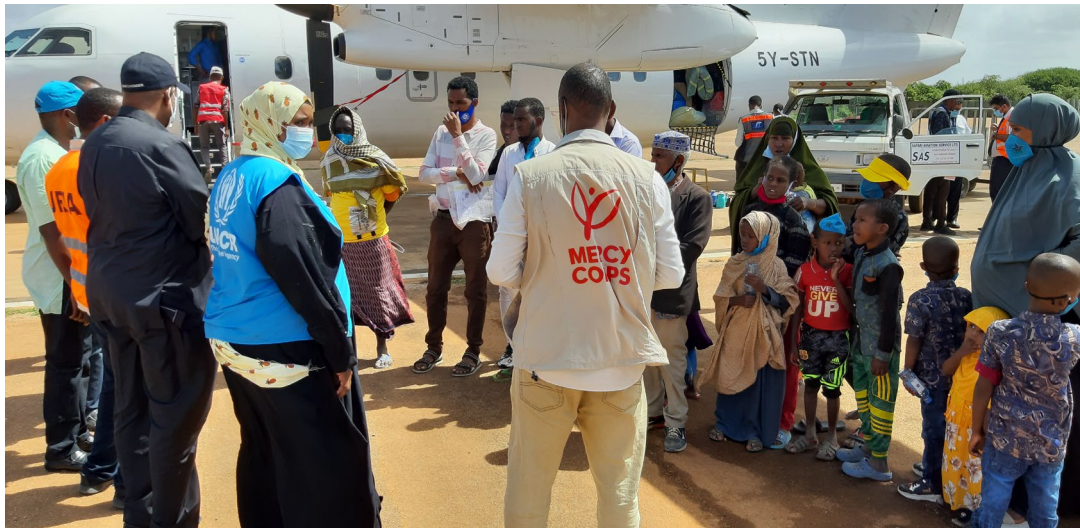
UNHCR and partners receiving Somali refugee returnees at Sayyid Mohammed Abulle Hassan Airport in Kismayo.