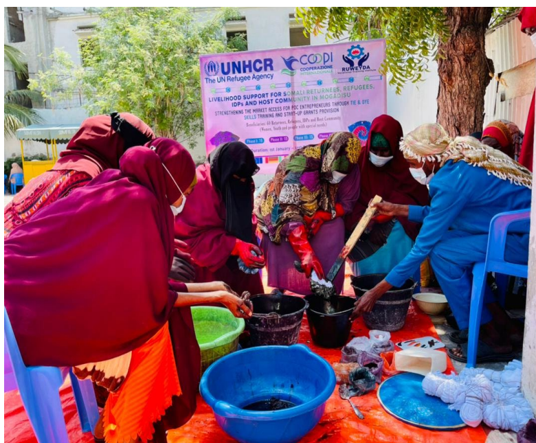
Students at a tie-dye class in Mogadishu