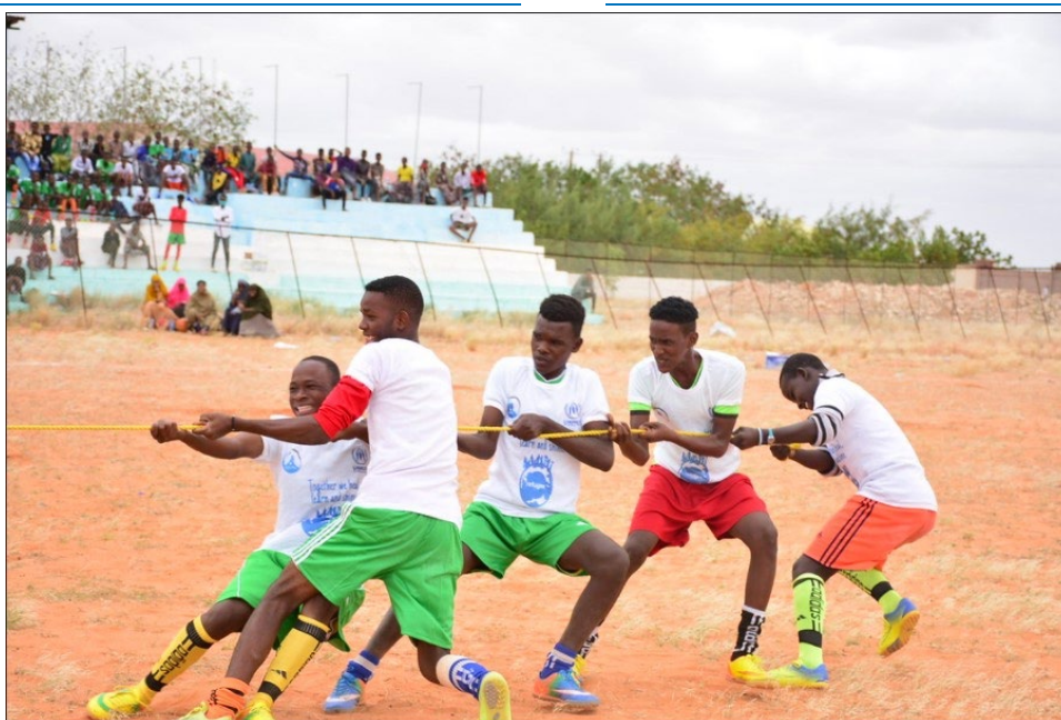
Youth in Bossaso participate in World Refugee Day commemorative activities