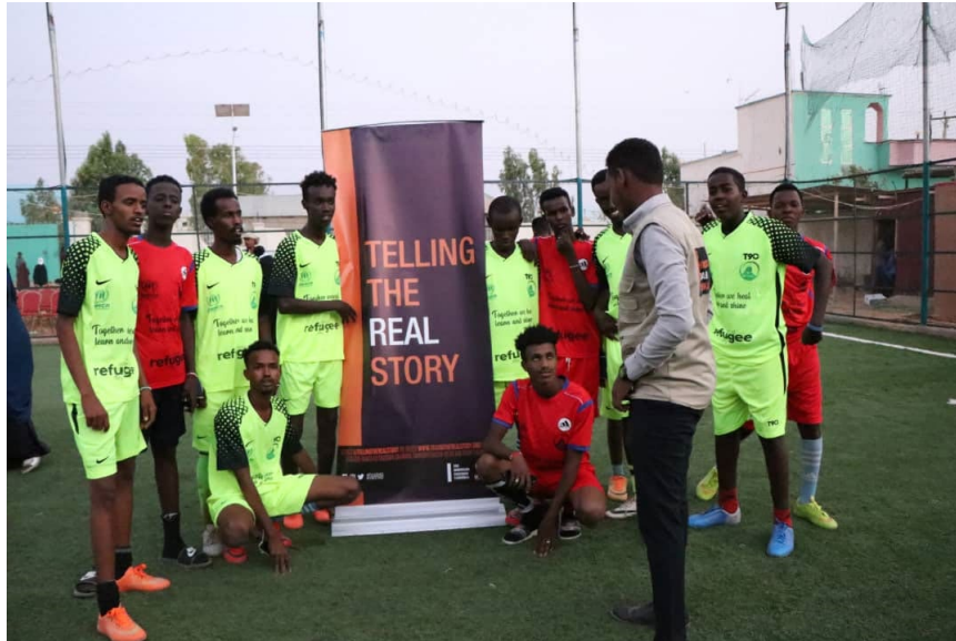
UNHCR/TRS Community outreach volunteers conducting an information sharing session with youth during World Refugee Day Celebration in Garowe. © UNHCR