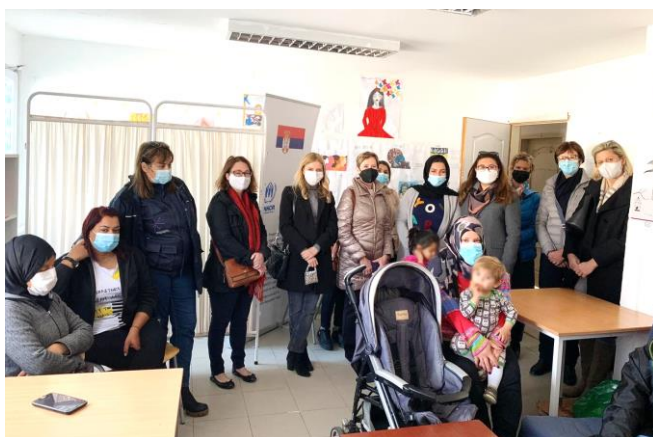
International Women's Club of Belgrade delivering humanitarian assistance to families with children in Krnjača Asylum Centre, Belgrade, @IWC, 1 Nov 2021

Over 100 refugees and asylum-seekers were assisted by UNHCR and partners in October in opting for local integration through finding employment opportunities and/or private accommodation, support to starting a business, support to education/reskilling and classes in Serbian language; 16 households/35 persons will be supported by UNHCR in November through cash-based intervention and one-time winterization allowance.