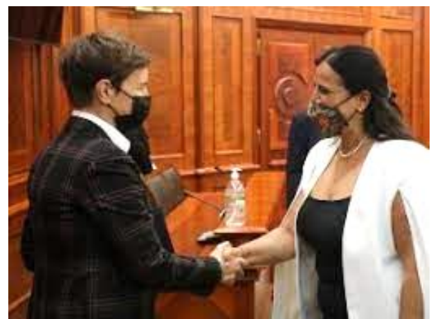
In her meeting with the UNHCR Representative, Prime Minister of Serbia Ana Brnabić noted the progress that Serbia has made in terms of protection of refugees, owing to cooperation with UNHCR, Oct 2021