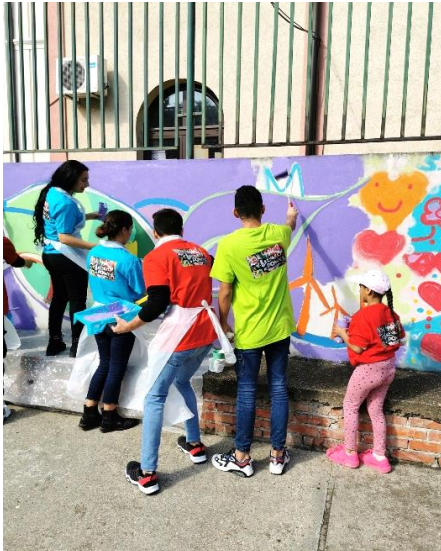
Refugee and Roma children painting a mural of friendship on the walls of Branko Pešić School in Zemun, Belgrade, Oct 2021

On 1 October, UNHCR/UNDP Young Volunteers project team organised a one-day event in the backyard of “Branko Pešić” school of further education in Zemun, which educates local and refugee children, gathering round schoolchildren, UNVs and unaccompanied and separated children from specialised institutions. The local and refugee youngsters involved in mural painting , which earned significant media coverage, sports, music and dance activities and competitions.