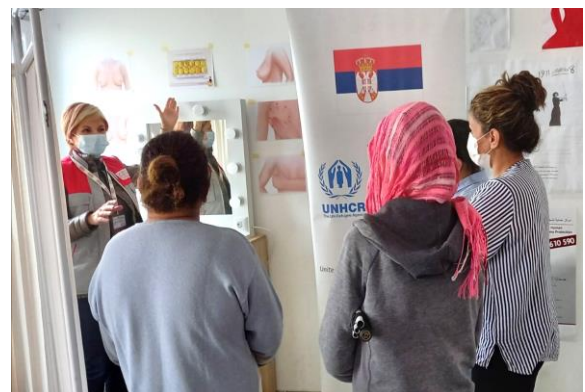
UNHCR partner Danish Refugee Council (DRC) established a breast self-examination corner in Krnjača Asylum Centre, @DRC, Oct 2021

With participation of UNHCR Representative on behalf of UNHCR & OSCE, in October, contracts were awarded in Ub and in Belgrade for apartments purchased for 35 (ex-Yugoslav) refugee families, under the Regional Housing Programme (RHP). On 26 Oct, keys to newly built apartments were awarded to 20 refugee families in Smederevo.