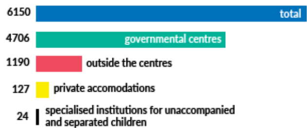
Number of refugees and migrants in Serbia's territory