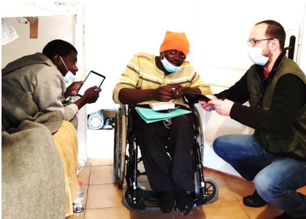
Two refugees in Krnjača AC were provided with tablets in support of their accessing online learning, @CRPC, May 2021

3,182 newcomers to governmental centres were registered in May (comp. to 4,344 in April). Arrivals came mainly through North Macedonia (78%), Bulgaria (12%), Albania (6%), Montenegro (4%) and a handful from Bosnia and Herzegovina and Turkey. More than 35% of all arrivals originate from Pakistan and 35% from Afghanistan, followed by [in order of predominance] Bangladesh, Iraq, Somalia, Syria, etc. May saw 1,186 (increase by 3%) pushbacks from neighboring countries to Serbia (59% from Hungary, 29% from Romania, 8% from Croatia and 4% from BiH). Nationals of Syria make up 42% of all the pushbacks, mainly men but also families, pushed back from Hungary, Romania, and Croatia.