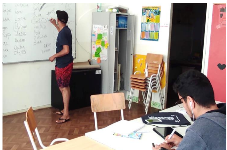
Refugees in Pirot RTC acquiring Serbian language, @Sigma plus, 21 May 2021