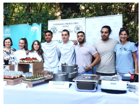
Delicacy Monday social cohesion event, Belgrade, 27 Sep 2021

UNHCR and partner CRPC supported three LGBTI asylum-seekers from Tunisia in participating in Belgrade Pride Parade on 18 Sep.