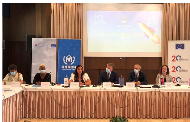
EQPR event in Belgrade with two young refugees recently enrolled in Belgrade University, ©UNHCR, 14 Sep 2021

In September, the Asylum Office (AO) of the Ministry of Interior (MoI) of Serbia made two recognitions, granting asylum to two applicants originating from Iraq (represented by UNHCR project lawyers); six applications by nationals of Jordan and Cuba were rejected in September by the AO. Three hundred and forty persons expressed intention to seek asylum in Serbia in September, and 20 submitted actual applications. 1,307 asylum-seekers newly arrived in governmental centres in September, and 1,256 absconded from them. By end-September, the AO has granted subsidiary protection to six and refugee status to five persons in 2021 .