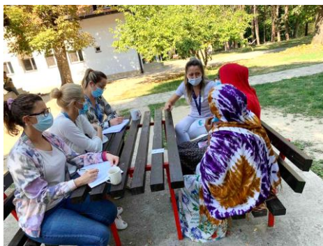
Asylum counselling in Bogovađa Asylum Centre, Sep 2021

Partners Danish Refugee Council, International Aid Network and Indigo organised over 235 psychosocial support, recreational, non-formal educational and interactive health workshops in asylum and reception centres throughout the country.