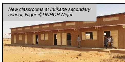
New classrooms at Intikane secondary school, Niger

In Niger , UNHCR has increased the capacity of the secondary school in the refugee reception area of Intikane , in the Tahoua region, by building three new classrooms to accommodate the new arrivals.