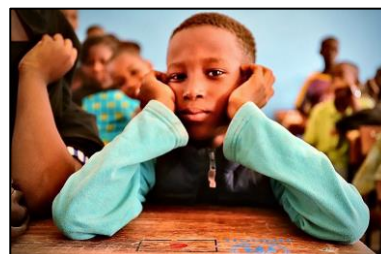
Student in a new classroom in Timbuktu, Mali

The increase in the frequency of attacks on civilians in the central Sahel , particularly in the tri-border region between Burkina Faso, Niger and Mali, has increased the concentration of refugee and IDP populations in urban and semi-urban areas considered to be safer, putting pressure on schools in these towns to absorb the new arrivals.