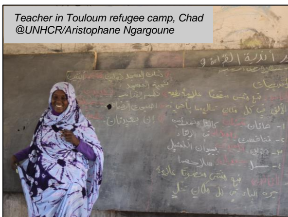
Teacher in Touloum refugee camp, Chad

Since the start of the Covid-19 pandemic, increased support has been provided to teachers in refugee camps in Chad, both during the period of school closure to ensure continuity of learning for students, and after school reopening to ensure a safe return to classes .