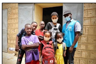
Children in front of a new classroom in Timbuktu, Mali

In Mali , three new fully equipped classrooms have been handed over this month by UNHCR to Timbuktu education authorities. Thanks to Japan’s Emergency Grant Aid , since last year UNHCR Mali has constructed, rehabilitated and equipped 30 classrooms in IDP, refugee and returnee hosting areas in central and northern Mali. The project also included distribution of learning materials for 1,500 school age children, and teacher training on inclusive education, psychosocial support, peace education and education in emergencies. The project