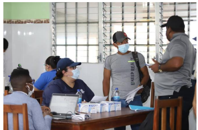
UNHCR was part of an interinstitutional mission to Darien to update and renew the documents of Colombian refugees and asylum seekers in remote locations of the province. ONPAR, the National Migration Service, the Civil Registry, the Ministry of Foreign Affairs, the Ministry of Labour and the Ombudsman's Office were part of the mission.

Movements of people entering through Darien (border with Colombia) increased during 2019 (more than 23,000 people 2 with small numbers requesting international protection Panama, whilst most others transited northward. In 2020, due to the pandemic, the number was significantly lower (6,465 people 2 ). As a result of border closures in March 2020, over 2,000 persons remain in the Reception Centers in Darien and Chiriquí. As of end of March, 5,472 persons 3 have entered through the Darien border. These persons remain in the Reception Centers of Lajas Blancas and San Vicente.