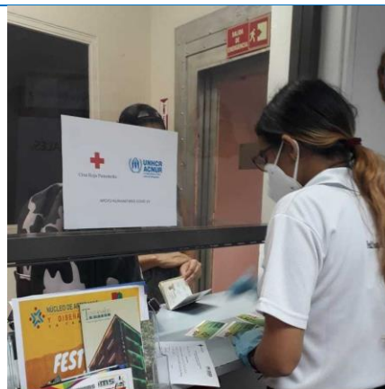
Panamanian Red Cross (CRP) provides cash-based assistance to refugee and asylum-seeking families with UNCR's support. During the COVID-19 measures in Panama, CRP continued supporting over 1,000 persons with cash grants to buy food supplies, medicine and pay rent.

The financial requirements of the North of Central America situation include requirements in Belize, Costa Rica, El Salvador, Guatemala, Honduras, Mexico and Panama MCO