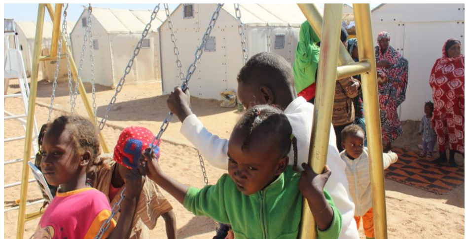
Refugee children awaiting resettlement playing at the humanitarian center in Agadez