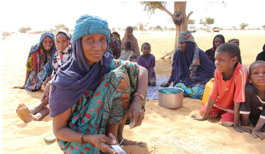
A group of internally displaced persons in Tahoua region