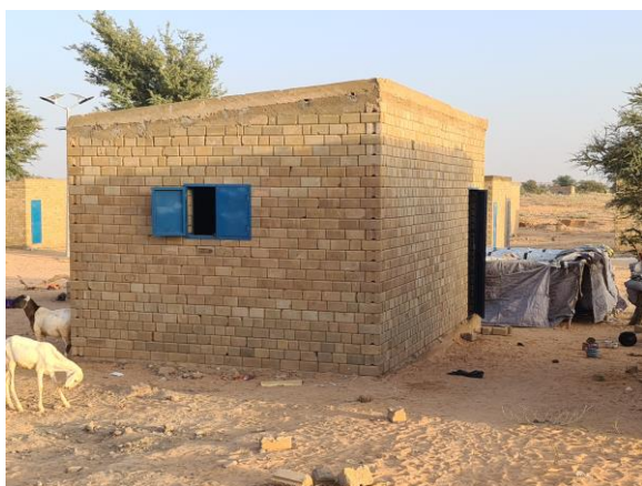
Construction of social housing for the most vulnerable refugees and host households is ongoing in the Tillabéri region. UNHCR has pledged to construct 4000 social houses in Tillabéri.