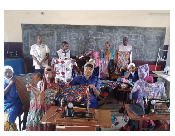
Nigerian refugee in training at the Diffa Trade Training Centre.