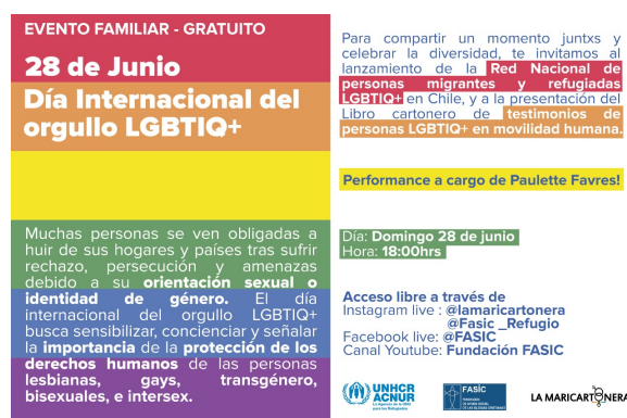
Flyer for for launch of the first national Network of refugee and migrant LGBTQI+ organizations

LGBTQI+ refugees and migrants often bear particular hardships due to their sexual orientation in their countries of origin, during displacement and upon arrival in their new country of asylum. The network hopes to create a safe space for LGBTQI+ refugees and migrants in Chile and further collaboration across the different community-based initiatives.