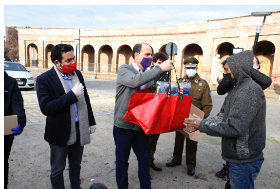
Cristián Monckeberg, Minister of Social Development and the Family deliver aid kits to vulnerable people.

“I want to thank UNHCR for its support. The Ministry of Social Development and Family does not only appreciate this effort but will make sure to channel it to some of the most vulnerable people in need ”, said the Minister of Social Development and the Family, Cristián Monckeberg, at the the launch of the campaign on 26 June.