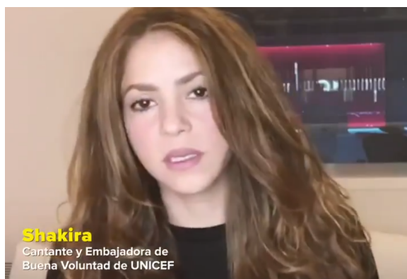
Shakira, singer and UNICEF goodwill ambassador, called for empathy this World Refugee Day

stigmatization that refugees and migrants have been faced with in recent months.