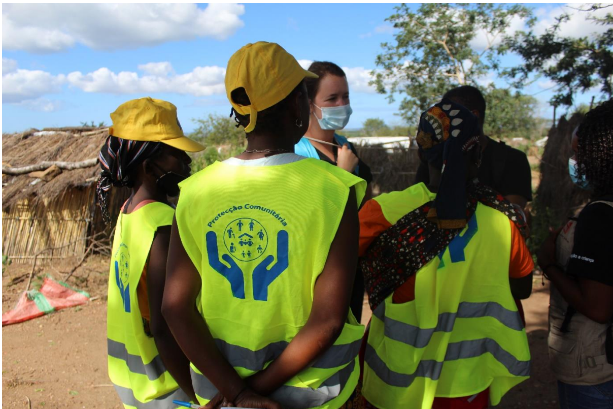
Protection Focal Points receiving guidance from UNHCR and partners in Ngalane IDP site, Metuge District, Cabo Delgado.

■ Training of Protection focal Points in Metuge, Cabo Delgado: UNHCR organized a training with 27 Protection Focal Points (PFPs) in Metuge, aimed at capacitating the PFPs in identifying and assessing the needs faced by persons with disabilities that are living at the IDP sites of Metuge. After the training, UNHCR and PFPs drafted a workplan to start the assessment immediately to allow the distribution of compensation materials to assist people with disabilities.