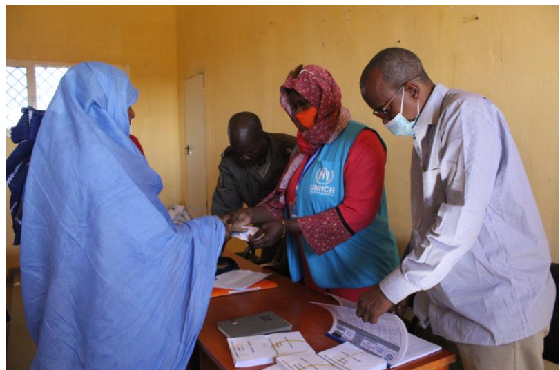
A refugee woman in the host community receiving cash assistance from UNHCR