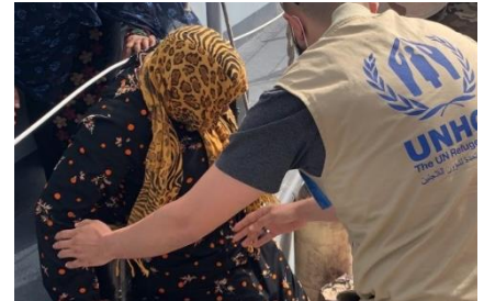
UNHCR provides medical support to persons recently disembarked in Tripoli.

So far in 2021, a total of 17,414 individuals have been reported as rescued / intercepted by the Libyan Coast Guard (LCG) and disembarked. Among those, 4,488 persons of concern to UNHCR have been identified, mainly Sudanese, Syrian and Eritrean nationals. More than half were disembarked at the Tripoli Naval Base (64 per cent), followed by the Tripoli Commercial Port (24 per cent) and Azzawya Oil Refinery Port (8 per cent). UNHCR and its medical partner the International Rescue Committee (IRC) remain present at disembarkation points to provide urgent medical assistance and Core Relief Items (CRIs).