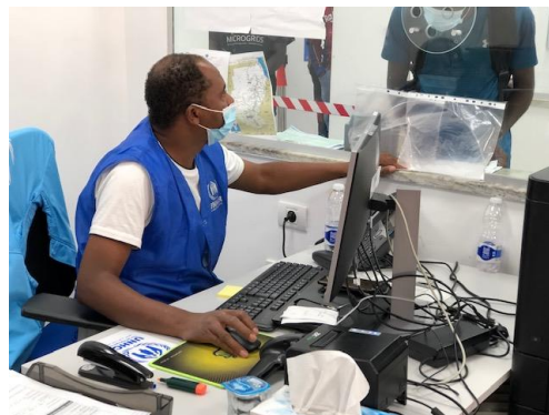
A UNHCR colleague processes refugees and asylum-seekers at the Registration Centre in Al-Sarraj district, Tripoli.

Last week, a total of 233 refugees and asylum-seekers approached UNHCR's Registration Centre in Tripoli and were processed according to their needs. Among them, UNHCR registered 79 individuals from Sudan (33), Syria (34), Palestine (6), South Sudan (3), Eritrea (1), Somalia (1) and Ethiopia (1). All newly registered persons received UNHCR certificates, providing them with identification that allows access to local services. Additionally, ongoing registration activities such as renewal of certificates and updating of data was carried out for 120 individuals. So far in 2021, UNHCR has registered 6,853 refugees and asylum-seekers in Libya.