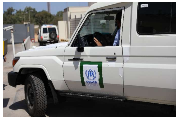
Ambulances donated to local municipalities leaving UNHCR's premises.

UNHCR continues to provide support for IDPs across Libya. As of 9 September, UNHCR and its national partner, LibAid distributed CRIs such as solar lamps, mattresses, heaters, clothes, hygiene kits, plastic sheets to some 25,000 IDPs. Cash assistance has also been provided to 763 IDPs and will continue to target more individuals in the upcoming months. In addition, a total of 665 IDPs have been provided with –information counselling and legal assistance to date.