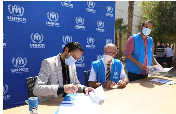
Handover ceremony of ambulances for four local municipalities and the Tripoli Primary Health Care Institute.