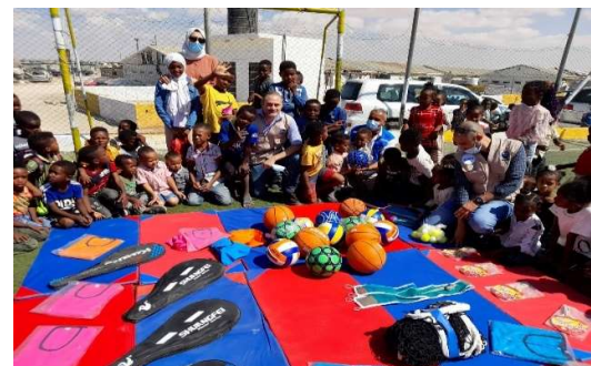
Sports kits provided to displaced children at Al Haleis Tawergha settlement.

On 5 October, sports kits were provided by UNHCR's Benghazi office to displaced Libyan youngsters at Al Haleis Tawergha settlement – the biggest in the east – as part of our support for local civil society organisations. Around 250 children will be able to use the items at a Child Friendly Space at the site funded by UNHCR and supported by partner ACTED, and non-governmental organisation, Amazonat.