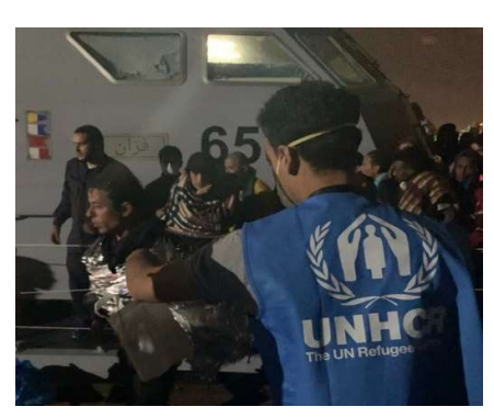
UNHCR staff providing assistance at the disembarkation point.

So far in 2021, a total of 26,705 refugees and migrants have been reported as rescued/intercepted by the Libyan Coast Guard (LCG). On 17 October, 98 people disembarked at Azzawya Refinery Point including five women and 12 children. On 18 October, 119 people disembarked at Tripoli Naval Base including ten women and five children. Most individuals were transferred to detention facilities. UNHCR and medical partner, the International Rescue Committee (IRC), were present at disembarkation points to provide urgent medical assistance and Core Relief Items (CRIs). So far this year, 194 boats