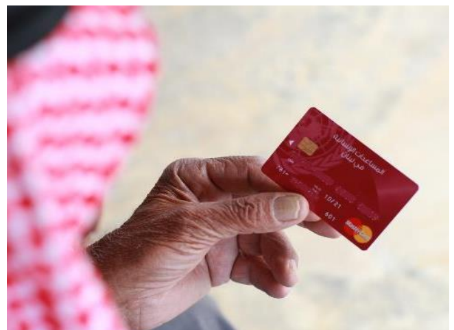
Refugee beneficiary holding the common card on which he receives monthly cash assistance. The numbers on the card have been blurred for protection and confidentiality purposes

** The decrease in beneficiary households in February coincides with the recalibration of the econometric formula. This yearly exercise ensures the update of the beneficiary lists on a yearly basis to reflect changes in the socio-economic situation of refugees.