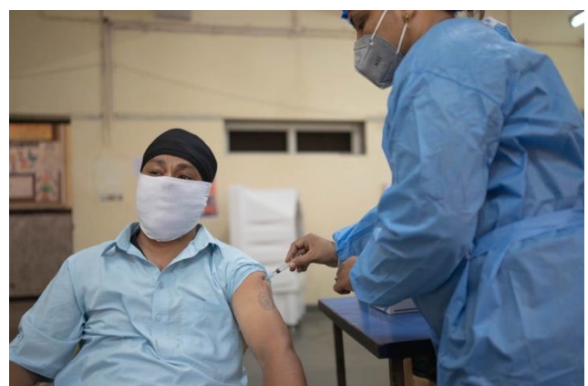
Refugees and asylum-seekers in Delhi receive their first jab of the coronavirus vaccine. Till 31 August 2021, 20,165 refugees and asylum seekers have been vaccinated, which includes the Sri Lankan refugees not registered with UNHCR.

Further, the socio-economic impact of the COVID-19 pandemic continues to affect refugees and asylum seekers. The number of refugees and asylum-seekers requesting basic assistance has increased, including for food, rent and medicines.