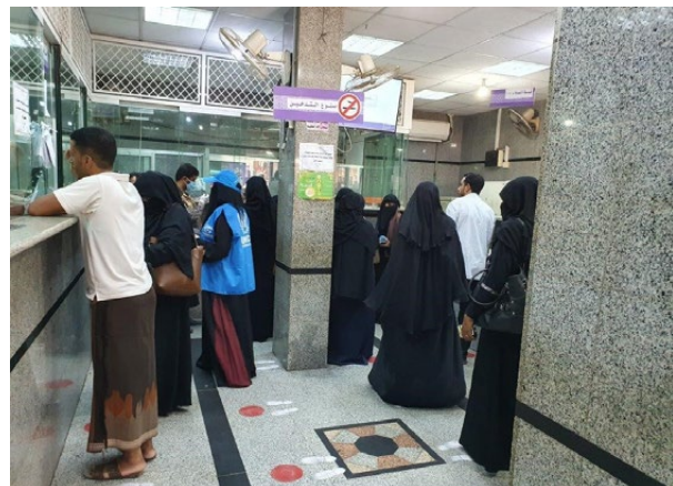
Internally displaced people are assisted to receive UNHCR cash assistance at the designated local bank in Yemen.

Acknowledging the opportunities and also the risks associated with cash assistance, UNHCR Yemen places strong attention on accountability to affected populations and on upholding integrity throughout the CBI implementation cycle. This is done through several procedural safeguards, such as household visits to better detect living conditions; the automated scoring system, based on objective criteria and limiting the subjectivity of the enumerators; verification of three to five per cent of the assessed beneficiaries to detect and correct assessment errors; identification for payment following know-your-customer principles, with beneficiaries uniquely identified through an individual SMS code and through the ID card recorded at the assessment time; post-