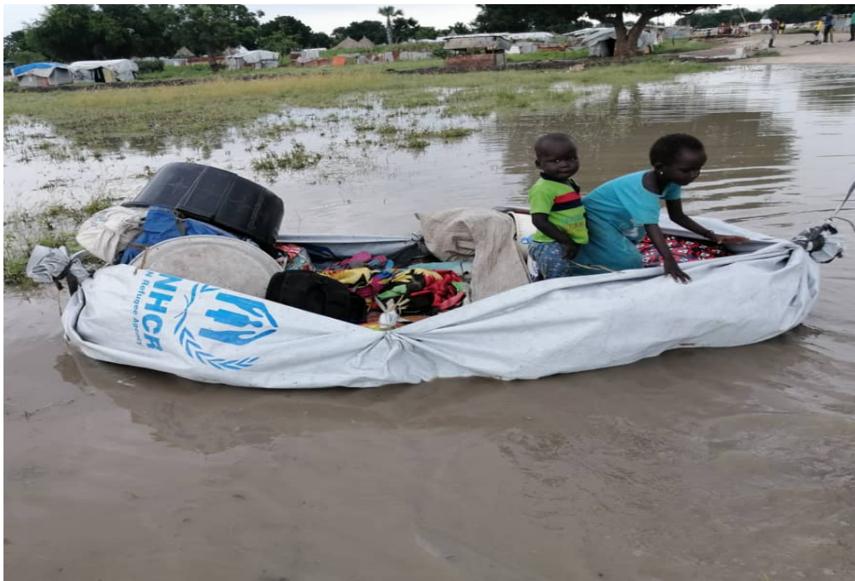
UNHCR plastic sheet used by displaced families for transportation to higher ground in Dhorbuoy, Leer county [Unity state]

In line with the 2019 IDP Policy, UNHCR South Sudan has stepped up its interventions to focus on transitional solutions through return and reintegration to improve the quality of life for IDPs, expanding geographic coverage to 11 new counties in six states, working through 16 partners (national international NGOs) who are spread throughout the country. This allows the most vulnerable IDPs to be targeted for assistance in areas of return and their current displacement