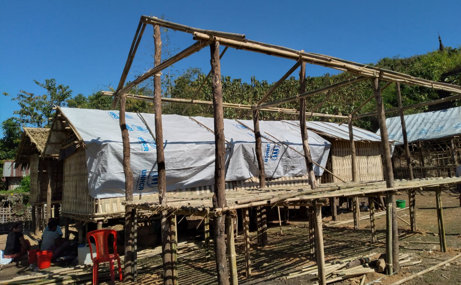
Rakhine State, Myanmar: Between May and December 2020, over 36,000 IDPs displaced by the AA-MAF conflict received shelter materials to construct improved shelters.