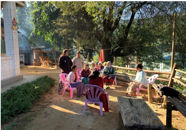
UNHCR and KBC staff conduct focus group discussions with IDP women to better understand needs and concerns in Chipwi Township, Kachin State.

solutions outside of camps as the security situation improved. In 2019, ceasefire negotiations between the Kachin Independence Army and the Myanmar Armed Forces resumed. As negotiations progressed and fighting subsided, prospects for durable solutions increased. KBC subsequently presented a plan on durable solutions and sought UNHCR's feedback and assistance in operationalizing it.