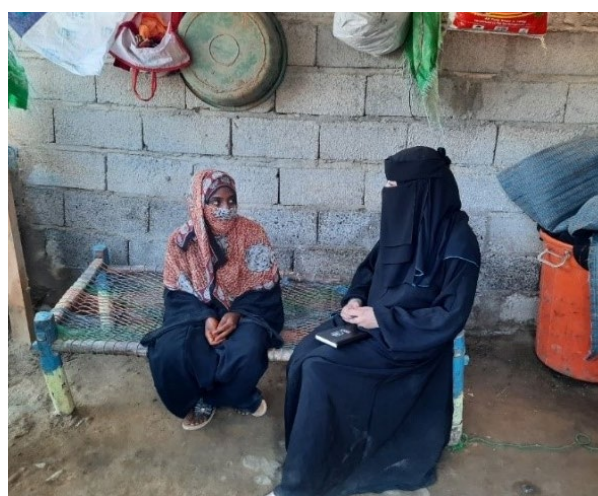
Assessment of an IDP woman heading a household in Hodeida

With its recognized focus on families displaced by conflict as per its mandate and expertise, UNHCR has established a solid methodology to assess the socio-economic situation and potential protection risks of the displaced population. The assessment tools, tailored to the specific context of the north and south of Yemen, capture critical socio-economic and demographic profile (e.g. family size, level of income, age/gender breakdown of head of household and dependents), current shelter type and conditions, protection profiles and specific needs, such as female-headed households, households with an elderly member, or persons with disability.