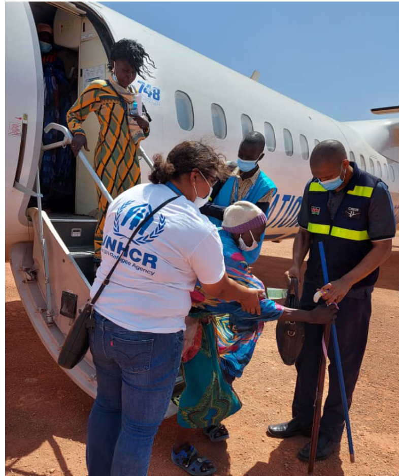
An elderly IDP woman is assisted to disembark a plane upon returning to Bentiu from Juba 13 Feb 2021

Quick impact projects: UNHCR will collaborate with implementing partners and UNMISS to support projects that improve basic infrastructure such as: roads in high return areas that will facilitate access to markets, goods and services, boost employment opportunities and enhance trade; drilling of boreholes; installation of lighting to ensure security and mitigate SGBV. Such initiatives will impact entire communities and serve as a catalyst for further investment in areas of return, and contribute to peaceful coexistence and social cohesion.