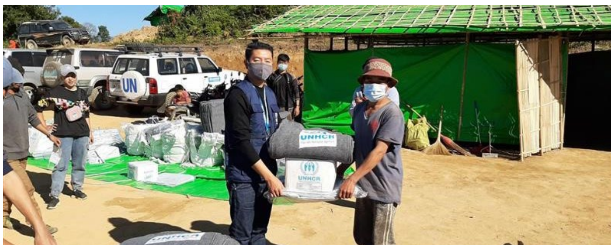
UNHCR and KBC teams provide household items to IDP families preparing return to villages nearby in Waingmaw Township, Kachin State.

Between 2012 and 2018, UNHCR's partnership with local CSOs like KBC was largely focused on the provision of camp-based humanitarian assistance to IDPs displaced by armed conflict. Years of careful relationship building on the ground enabled UNHCR to be viewed as a trusted partner. Priorities gradually shifted to long term