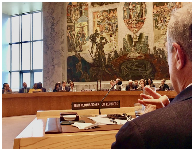
UN High Commissioner for Refugees, Filippo Grandi, preparing to brief the Security Council upon the invitation of Germany in April 2019. These annual briefings allow the Council to appreciate how it can help protect and find solutions for the forcibly displaced worldwide.

Country-specific GA resolutions, some of which speak to the situation of IDPs can call on the SG to allocate additional resources and support, for instance by appointing a special envoy as in the case of Myanmar, and also recognize a specific role for UNHCR on issues like refugee returns.