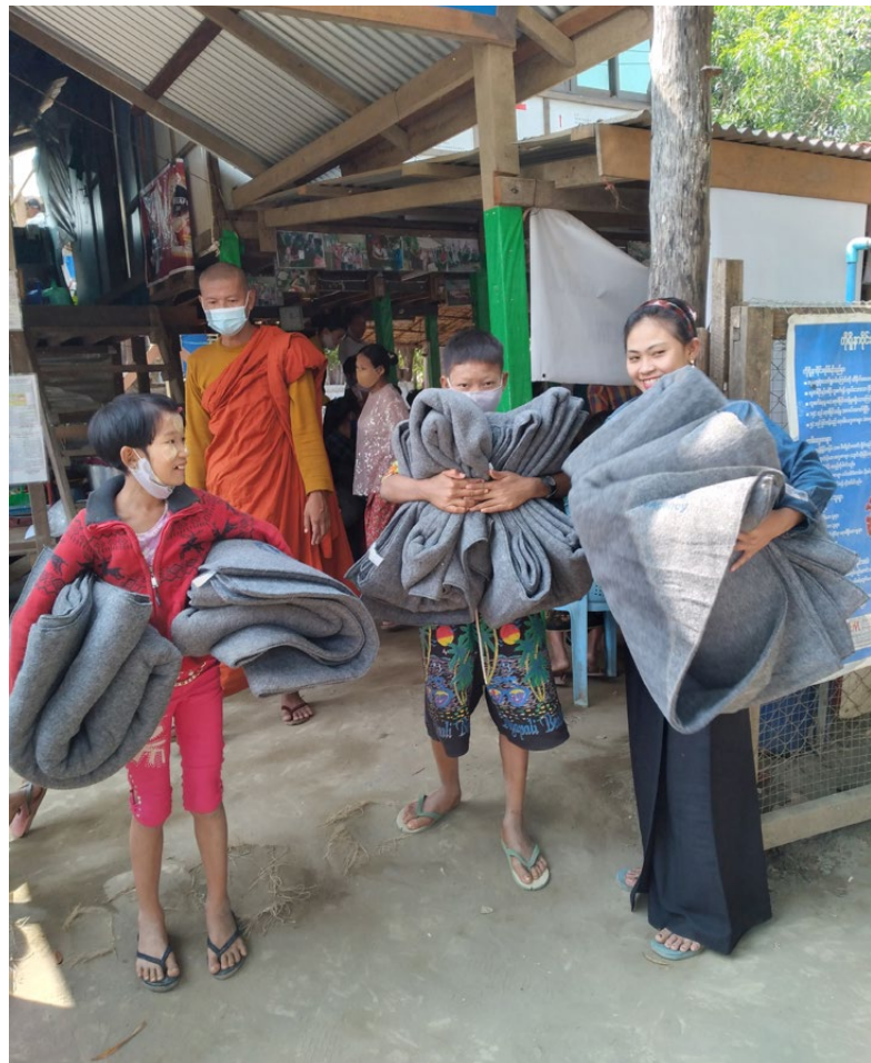
Rakhine State, Myanmar: IDPs receive blankets to keep warm during the cold season.

The speed and efficiency with which aid is distributed to IDPs in Rakhine State is testament to the importance and effectiveness of information management strategies in overcoming various challenges faced by humanitarian partners in Rakhine State. By working closely in partnership with partners on the ground, humanitarian actors are able to achieve a robust operational response where the whole is greater than the sum of its parts.