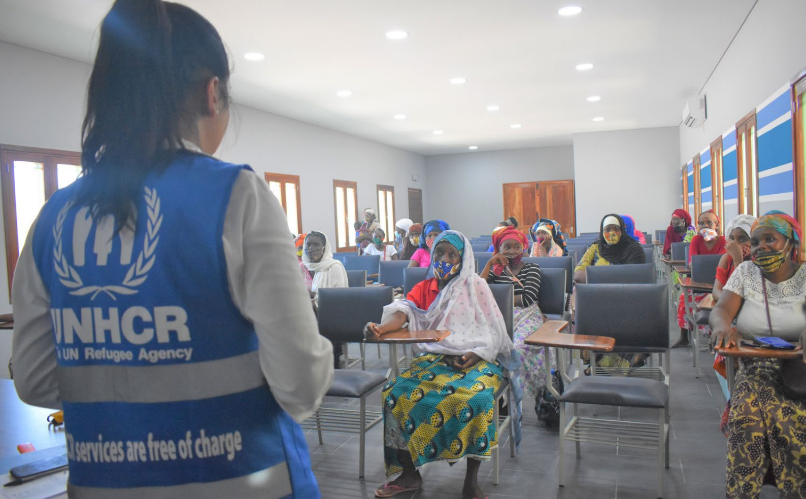
UNHCR and GIZ providing training on sewing and entrepreneurship skills to IDP women in Nampula, Mozambique