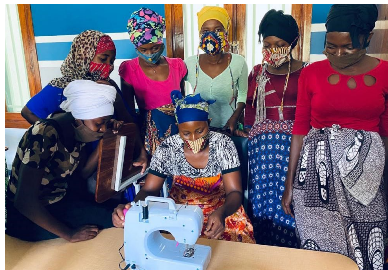
UNHCR and GIZ provides training on sewing and entrepreneurship skills to IDP women in Nampula, Mozambique.

With UNHCR technical support, Mozambique has ratified the African Union Convention for the Protection and Assistance of Internally Displaced Persons in Africa (Kampala Convention) in 2019 and deposited the instrument of ratification in 2020, a significant achievement for a country facing a critical internal displacement situation. However, the government requires support in the process of domesticating and translating this international instrument into national legislation and action plans that will promote socioeconomic solutions for IDPs and host communities.