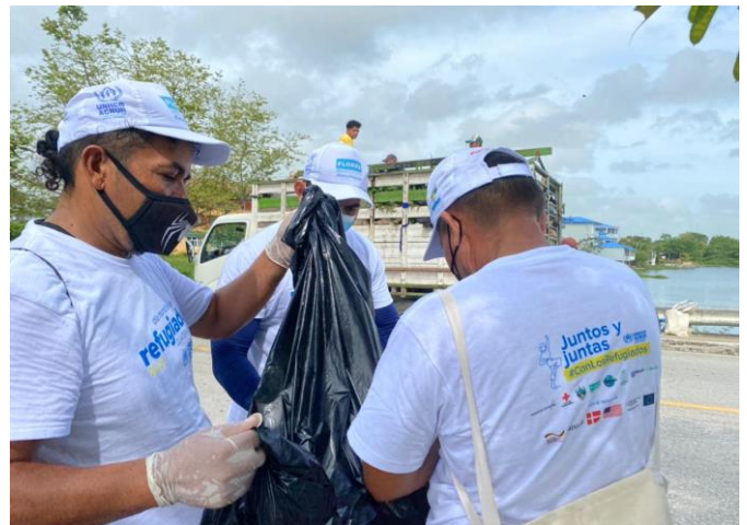
In Petén clean-up activities of the lake were conducted with the support of partners and local authorities, with the participation of refugees