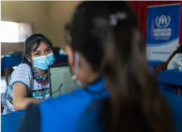
UNHCR in coordination with partners conducts registration activities in vulnerable host communities to provide assistance