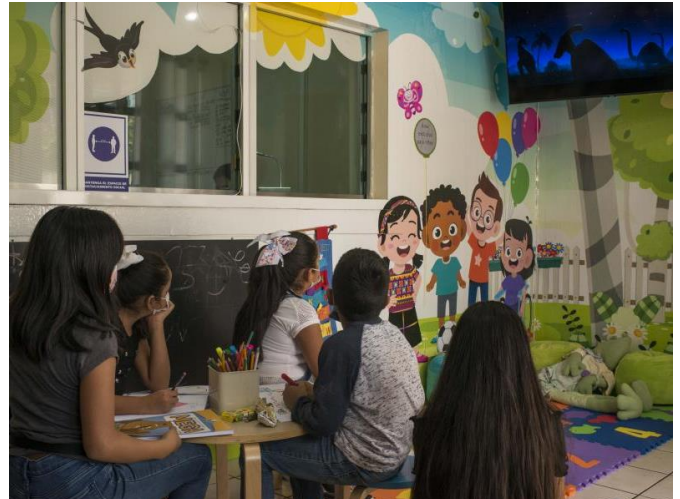
UNHCR in coordination with partners provides temporary shelter for people of concern at risk, including children